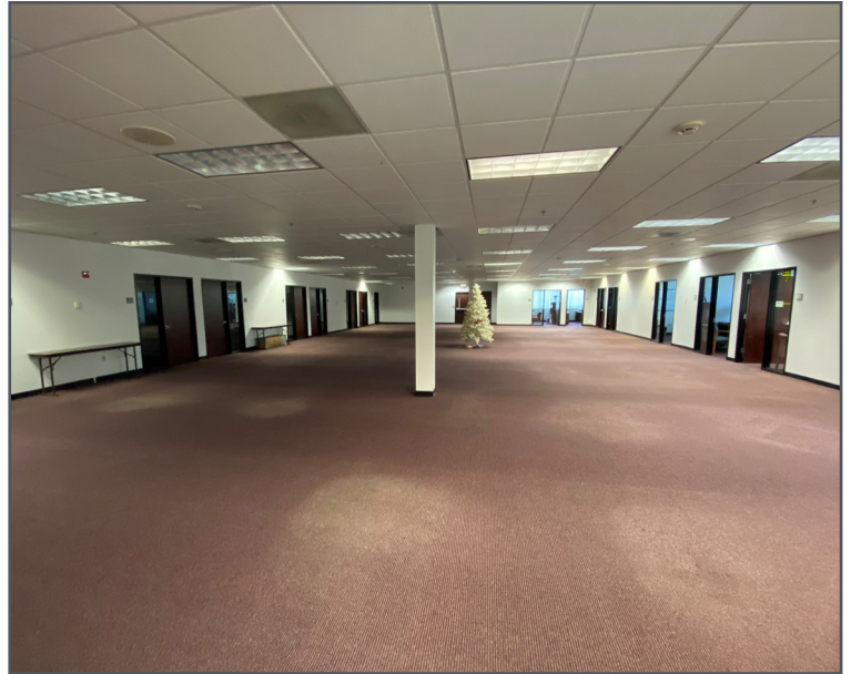
OPEN OFFICE PLAN